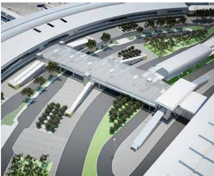
An artist's impression of the elevated walkway that will link the new multi-level car park to the front of the Domestic Terminal.

Skywalk will provide lifts, travelators and escalators to take visitors to the ground immediately outside the Domestic Terminal. It will also allow easy pedestrian access to Airtrain.