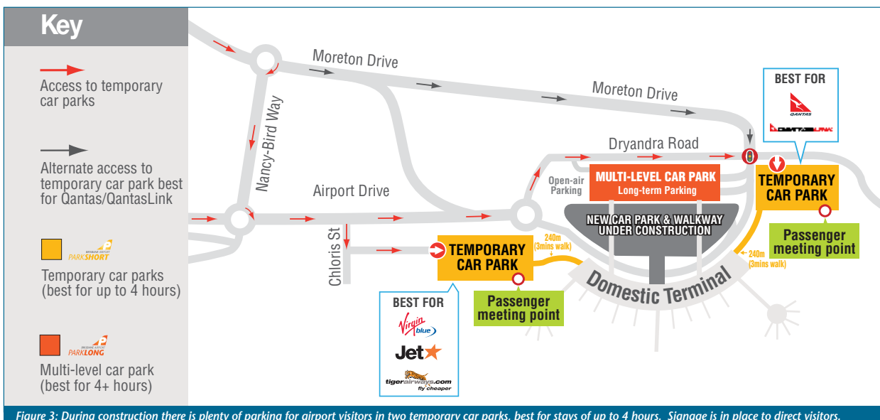
Figure 3: During construction there is plenty of parking for airport visitors in two temporary car parks, best for stays of up to 4 hours. Signage is in place to direct visitors.