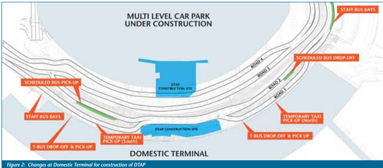
Figure 2: Changes at Domestic Terminal for construction of DTAP

Collect a paper ticket and present it to the new customer service window for verification on entry.