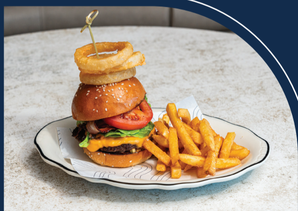
QLD LONGHORN CHEESEBURGER WITH THE LOT 32 (GFO) Longhorn beef patty, cheese, bacon, tomato, lettuce, fried onion rings, special sauce