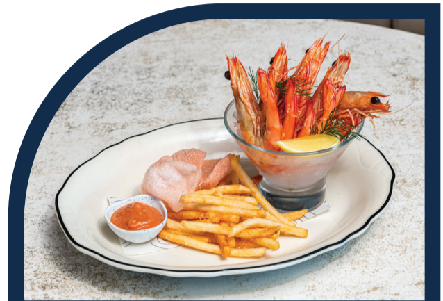
MOOLOOLABA PRAWN BUCKET 28 (GFO, DF) Thin cut chips, cocktail sauce

FIVE SPICE FRIED CHICKEN WINGS 18 (DF) w/ chilli crisp sauce