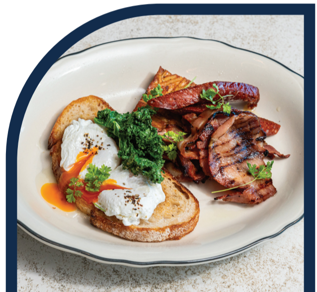
ALL IN BREAKFAST: MEAT 31 (GFO) 2 free range eggs, crispy bacon, chorizo, hash potatoes, sourdough toast

AVOCADO ON TOAST 21 (V, GFO) w/ creamy feta