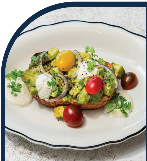
AVOCADO ON TOAST 21 (V, GFO) w/ creamy feta

Free range eggs, bell peppers, chorizo, mushrooms, Manchego cheese, sourdough toast