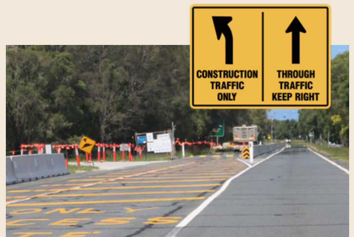
Airport drive inbound

NOTE: With the increased construction traffic, motorists are urged to drive with caution, be aware of changed traffic conditions and follow traffic signs.