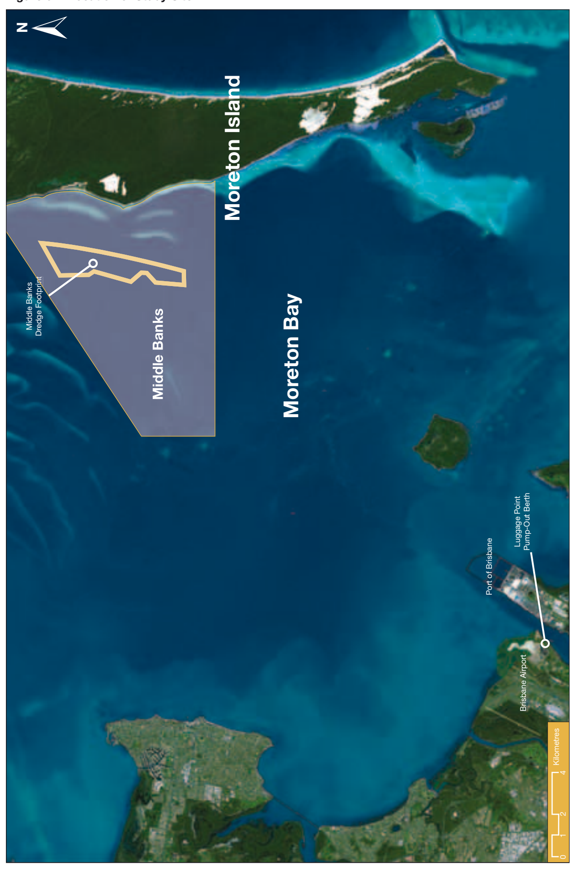
Figure 8.1: Location of Study Site.