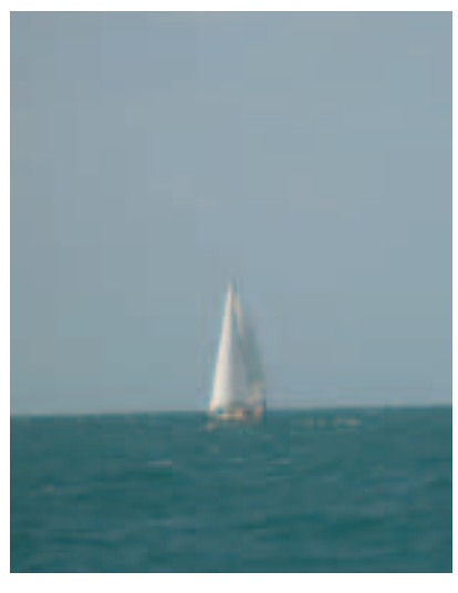
Recreational boating activity in the Bay