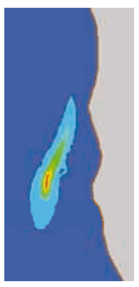
Figure 8.2: Potential Location and Extent of Plume.

The dredging activity will be completed during the beginning phases of the construction program for the project and last for a duration of 12 - 18 months.