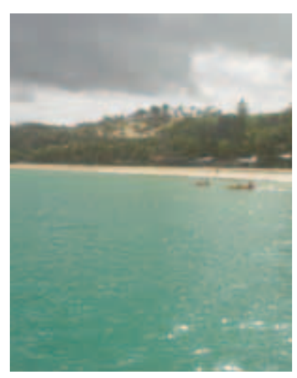
View to Moreton Island