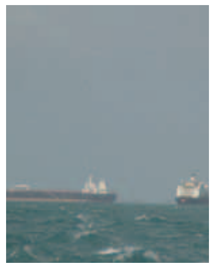
Large Freight Ships in the Main Shipping Channel