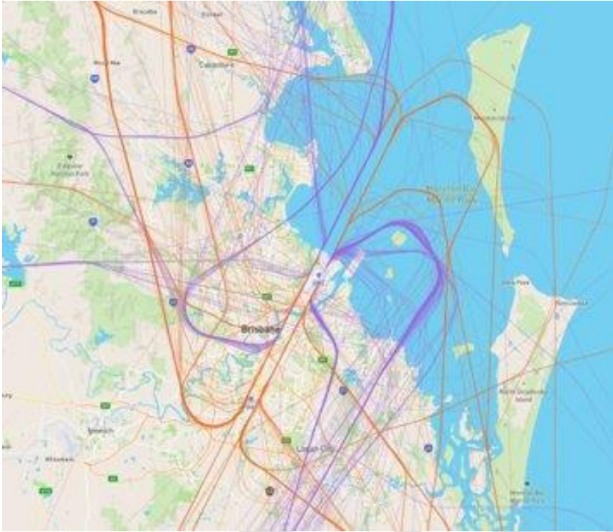
24 Nov 22 (577 movements)